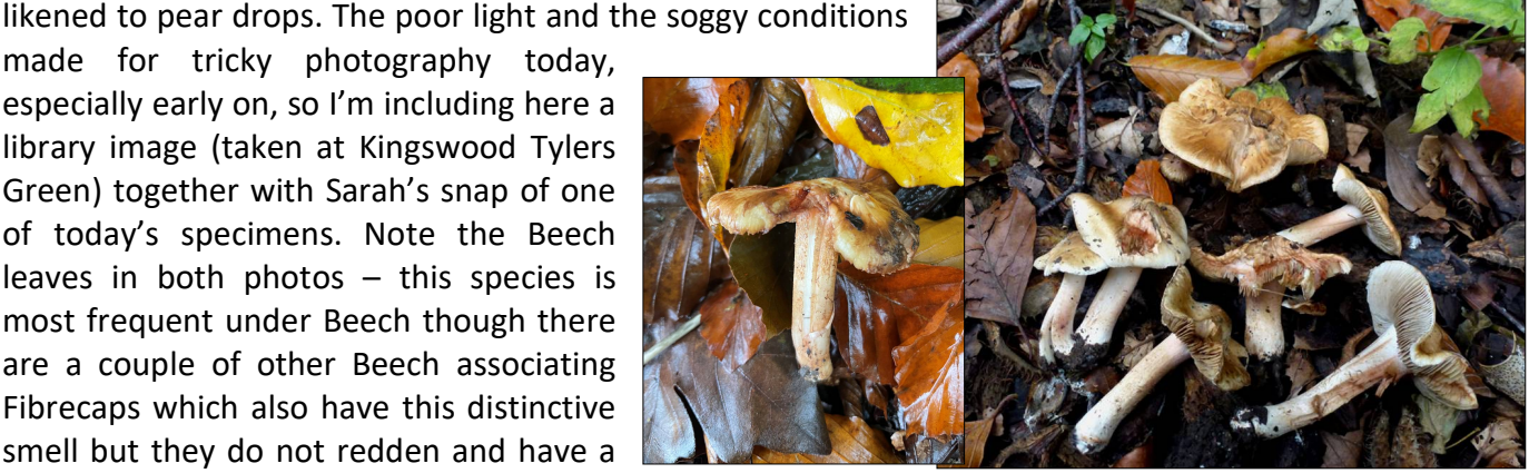
Above: Inocybe fraudans (PC with inset SJE)

made for tricky photography today, especially early on, so I'm including here a library image (taken at Kingswood Tylers Green) together with Sarah's snap of one of today's specimens. Note the Beech leaves in both photos – this species is most frequent under Beech though there are a couple of other Beech associating Fibrecaps which also have this distinctive smell but they do not redden and have a different 'jizz'.