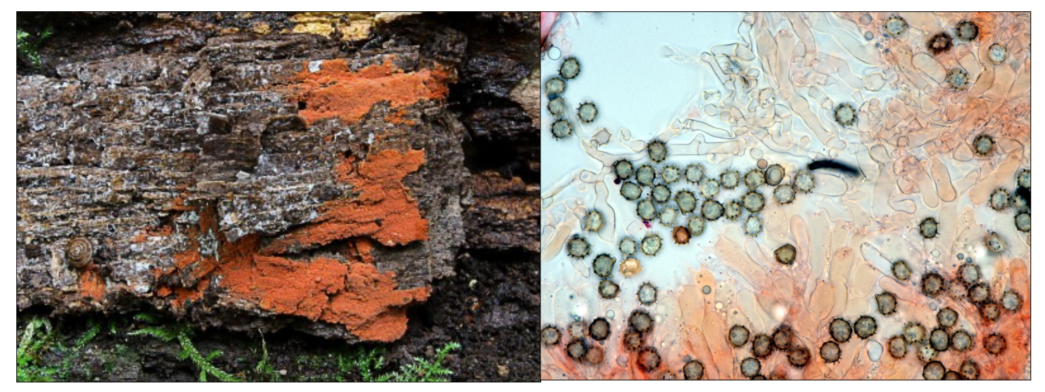
Above: Tomentella umbrinospora with micrograph x 1000 showing the spores and clamped hyphae. (cvs)

One collection which eluded determination was found in the path amongst the Beech litter as we walked back. The pink decurrent gills and white cap strongly suggested a species of Clitopilus (Miller) but it was almost stemless and rather misshapen and both arah and I, who not only found it separately but also made a stab at identifying it at home, came up with a possible name, Clitopilus scyphoides , which later was confirmed for us with sequencing. This was new to Dancersend with very few county records.