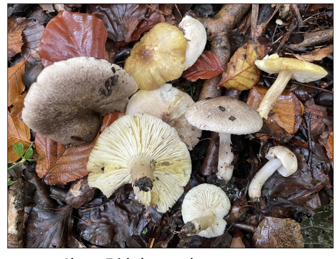
Above: Tricholoma scalpturatum (SJE)

by date and collapsing as we looked at it! I'd no idea of its identity but noted that it was yellowing strongly. This was soon followed by nice fresh specimens of Tricholoma scalpturatum (Yellowing Knight) with pale grey-brown slightly scaly cap and growing in almost complete rings. A characteristic of this species is the fact that it tends to turn yellow where damaged, a feature which helps to separate it from the many other grey-capped Knights. No doubt our dilapidated mushroom was also this species which also has a mealy smell, though smells today — with many mushrooms being pretty waterlogged — were not of that much use for identification purposes. I find this species very commonly under Birch.