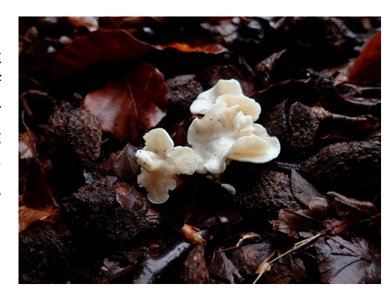
Right: the unusual Clitopilus scyphoides (PC)

One collection which eluded determination was found in the path amongst the Beech litter as we walked back. The pink decurrent gills and white cap strongly suggested a species of Clitopilus (Miller) but it was almost stemless and rather misshapen and both arah and I, who not only found it separately but also made a stab at identifying it at home, came up with a possible name, Clitopilus scyphoides , which later was confirmed for us with sequencing. This was new to Dancersend with very few county records.