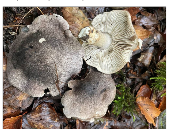
Above: Tricholoma orirubens (SJE)

Nearby a much darker capped Tricholoma was found, also in good numbers and in good condition. With its almost black cap centre and scaly surface, also distinct blackening visible on some gill edges, this appeared to be Tricholoma atrosquamosum (Dark Scaled Knight). However, despite no sign of the telltale reddening or blueing at the stem base overnight – indicating either T. basirubens which reddens or T. orirubens which blues – when sequenced a few months later this collection in fact matched T. orirubens – a species we found at the adjacent Round Spring Wood in 2022 when the stem base became convincingly blue. It just goes to prove how looks alone can deceive!